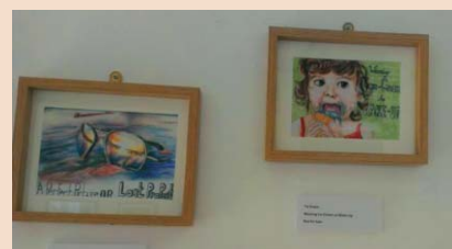
Last year's Open Exhibition exhibits

For more information or to obtain a booking form including an Exhibitor Pack containing terms and conditions please visit the Atkins Building website or email info@atkinsbuilding.co.uk